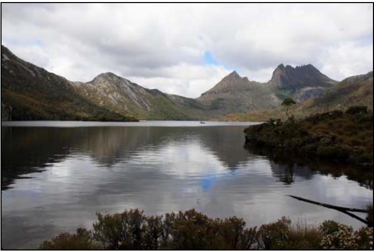
RUGGED & PRISTINE: Cradle Mountain, Tasmania, from Lake Dove.