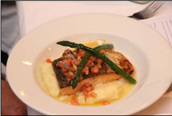
Fish Dish à la Metropolitan Hotel